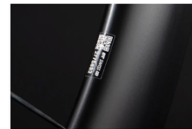
1. Check your rim between the spokes.

The DT Swiss ID sticker can be found in three positions on the rim.