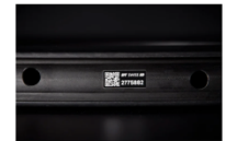
3. Check the rim well.

If the stickers with the DT Swiss ID number on your product are no longer visible in the locations shown above or have become illegible due to wear or aging, you can also send us the rim series number located under the rim tape to the email address recall@dtswiss.com (see image below). With this number, our team can perform a manual search to check whether your product is affected by the product safety recall.