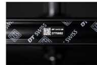
2. Check on the rim tape.